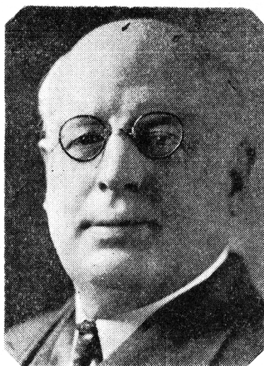
WILLIAM ABERHART, B.A.

Called home to glory on Sunday, May 23rd, 1943, at Vancouver, British Columbia.