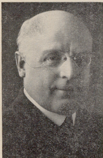
HON. WILLIAM ABERHART Premier of Alberta 1935 - 1943

This evening the Aberhart Memorial Sanatorium is being opened. It is appropriate that this new institution—one of the finest of its kind in Canada—should be dedicated to the memory of the late Premier William Aberhart. Until his death in 1943, Premier Aberhart maintained a keen interest in health problems, and it was during his term of office that the health service program of Alberta was broadened and intensified.