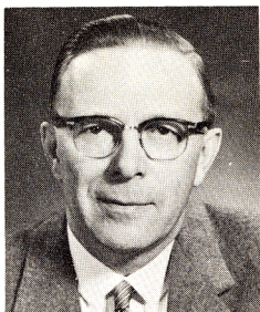
Hon. E. C. Manning

In the thirty years during which the Social Credit Government has worked to further the interests of its people, Alberta has become the leading Province in Canada.