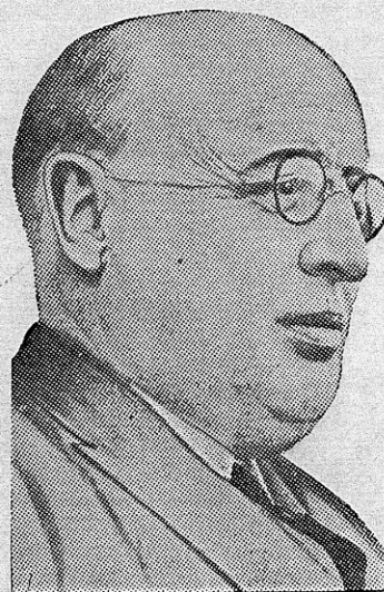
WILLIAM ABERHART, B.A., Premier of Alberta