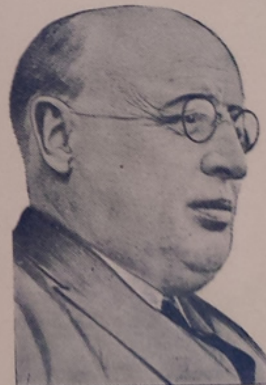
WILLIAM ABERHART, B.A., Premier of Alberta

The LORD hath done great things for us: Whereof we are glad. Ps. 126:3.