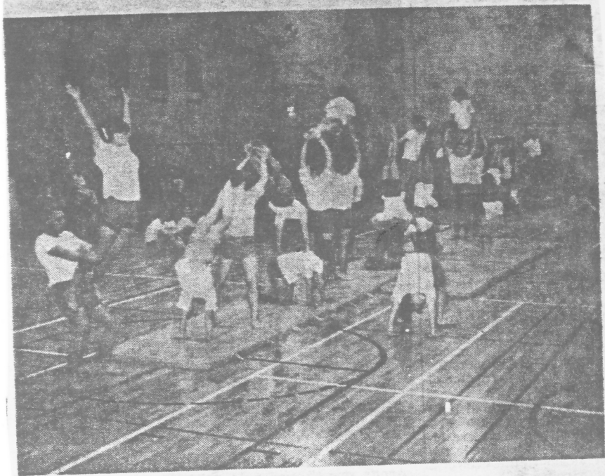
Boys and girls from Phys.Ed. 20 form pyramids in a gymnasium display at Ernest Manning High School.