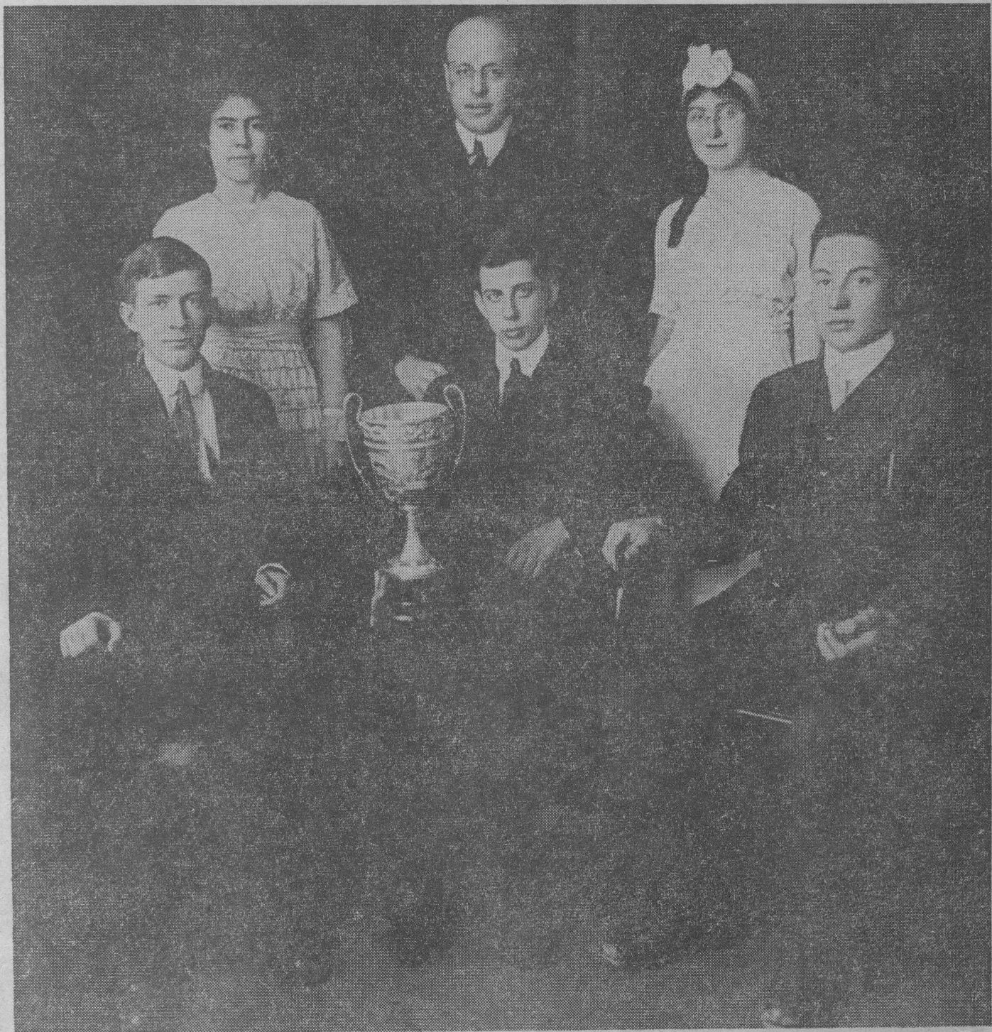
FAMED PRINCIPAL. Third and best known of Crescent Heights High School principals was William Aberhart who left the school to become the first Social Credit premier of Alberta. He joined the school's staff in the unsettled first years and remained as principal until he went into politics in the 1930s. Here he is shown top centre with one of the early school debating teams.