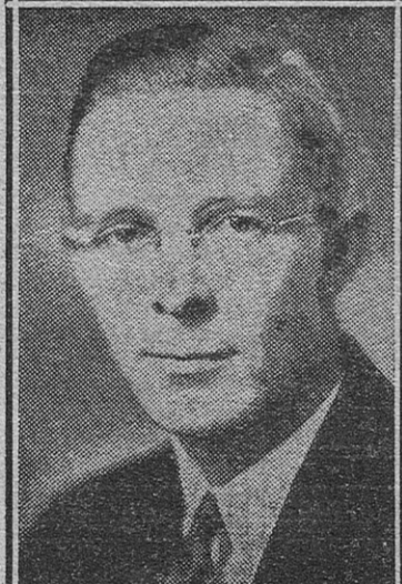
Hon. E. C. Manning